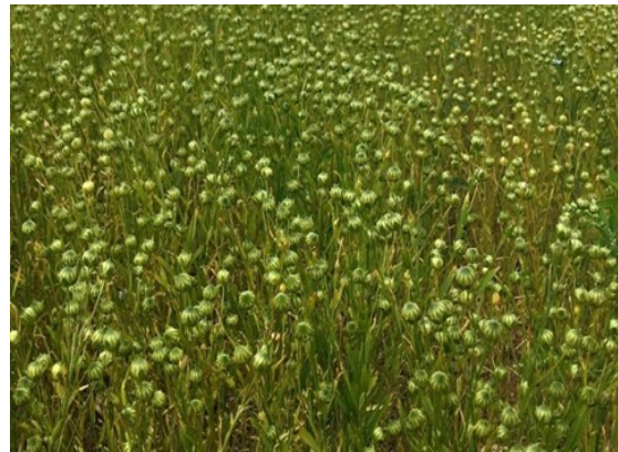
Linseed in Hampshire

This Bulletin is for commercial crops only. A separate bulletin will be issued for seed crops