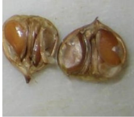
Figure 1: desiccation timing for diquat on linseed. Left hand picture too early, right hand picture just right