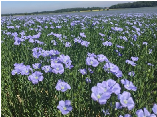
Linseed in Cambridge

Linseed crops are at variable growth stages throughout the country, ranging from the start to the end of flowering. In this hot weather crops at the end of flowering are turning quickly. For most growers the Linseed will be harvested straight after their Wheat.