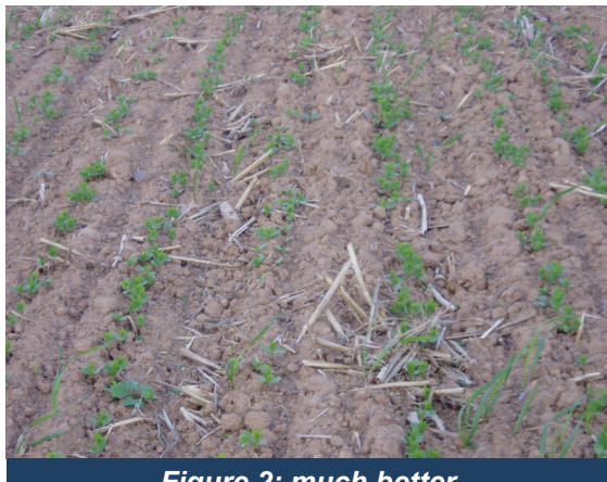
Figure 2: much better